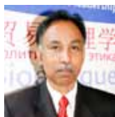
Mr. S.D. Shibulal India Chief Executive Officer, Co-founder and Member of Board Infosys Technologies Ltd.