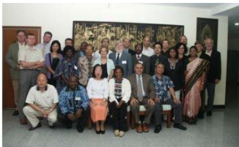
Participants from 22 countries, representing 5 continents, at the Globethics.net International conference 2005

It was the task of the workshops, held in four sessions during the conference, to further specify ethical criteria for Responsible Leadership through the discussion, in the workshop groups, of the papers submitted by the individual participants and through further examination of the keynote addresses. Although in two workshop groups the discussions suffered from the fact that some participants were asked to work on assigned issues rather than on issues of their particular sphere of specialisation, most groups, particularly those on Religious Leadership, Business Leadership, and Political Leadership, shared vivid debates both on papers and on the overall criteria for Responsible Leadership. Each workshop group was asked to present a sketch of such criteria that it explored during its discussions. The criteria put together by the workshop groups served as a starting point for a common document discussed as the outcome of the conference.