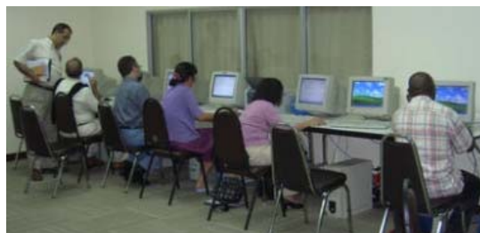
Electronic networking training session at the International Conference

One of the core aims of Globethics.net is to encourage and to strengthen global exchange on ethical issues through web-based research and discussion activities. The intention is to provide means and space for sharing ethical concerns in particular for researchers and ethicists evolving in southern and transition countries and to allow them to better participate in the worldwide ethical debates without having to afford high travel costs. From the beginning, the Globethics.net internet platform was specifically designed to meet this purpose. However, as an outcome of the Bangkok conference, some major modifications were introduced to the website, delaying for two months the launch of the actual work of online working groups (see section 5.3 of this paragraph for the working groups). The modifications described below were initiated immediately after the Bangkok conference and took effect in December 2005.