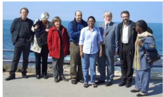
The Globethics.net Board at its yearly meeting

The board held two meetings throughout 2005. The first meeting was taken place on March 4 and 5 in Zurich, Switzerland. The location was chosen with the purpose of allowing the board members to get a clear picture of the context in which Globethics.net evolves. In addition to the regular